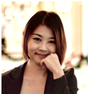
Tzu-Ying Huang 黃姿穎

旅美台灣單簧管演奏家黃姿穎，目前擔任聖路易斯交響樂團 (Saint Louis Symphony) 單簧管以及低音單簧管演奏家。曾經擔任堪薩斯城交響樂團 (Kansas City Symphony) 以及科羅拉多音樂節 (Colorado Music Festival) 單簧管及低音單簧管演奏家。旅美期間足跡遍佈美國各大城市，如紐約卡內基音樂廳以及洛杉磯迪士尼音樂廳，並隨樂團赴歐洲巡演。